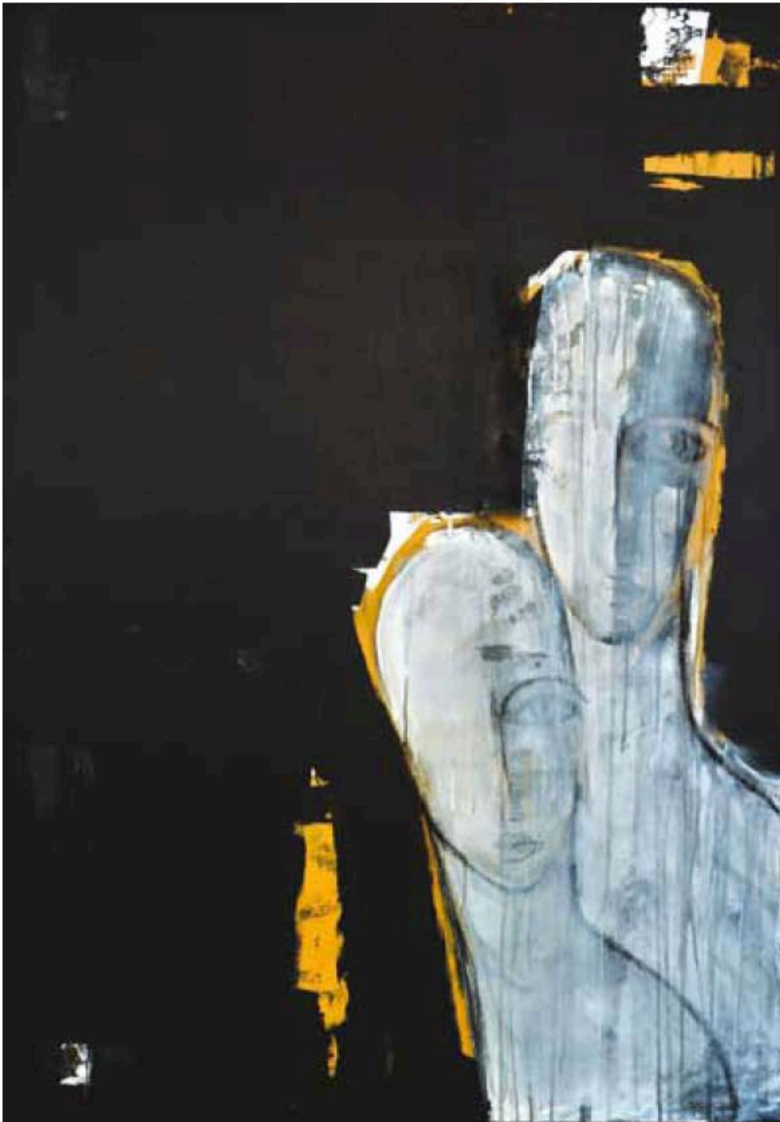
Jehan Saleh | "Relationship 1" | Acrylic on canvas | 130cm x 90cm | 2010