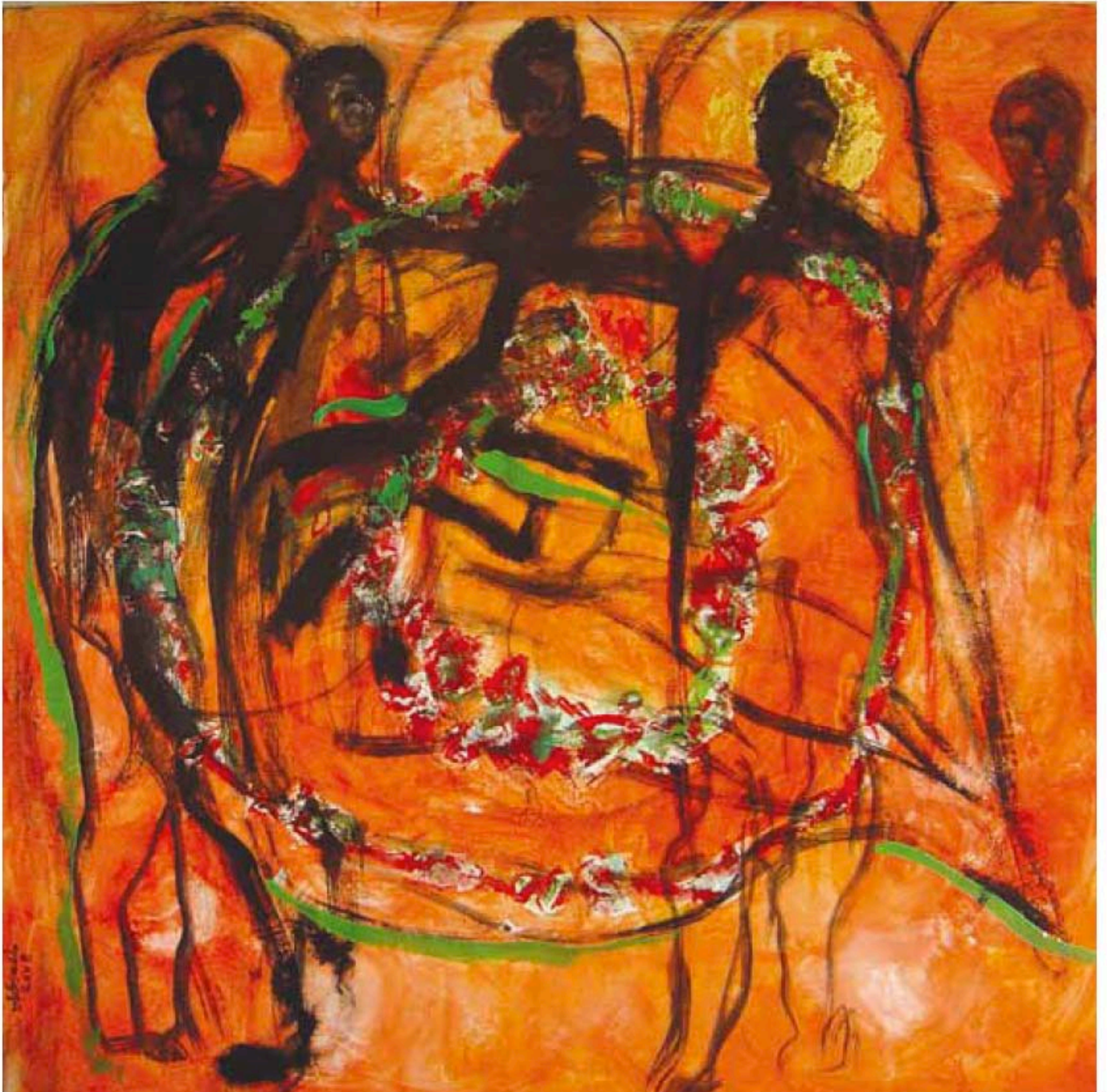
Haela Al Waary | Mixed media on Canvas | 120cm x 120cm