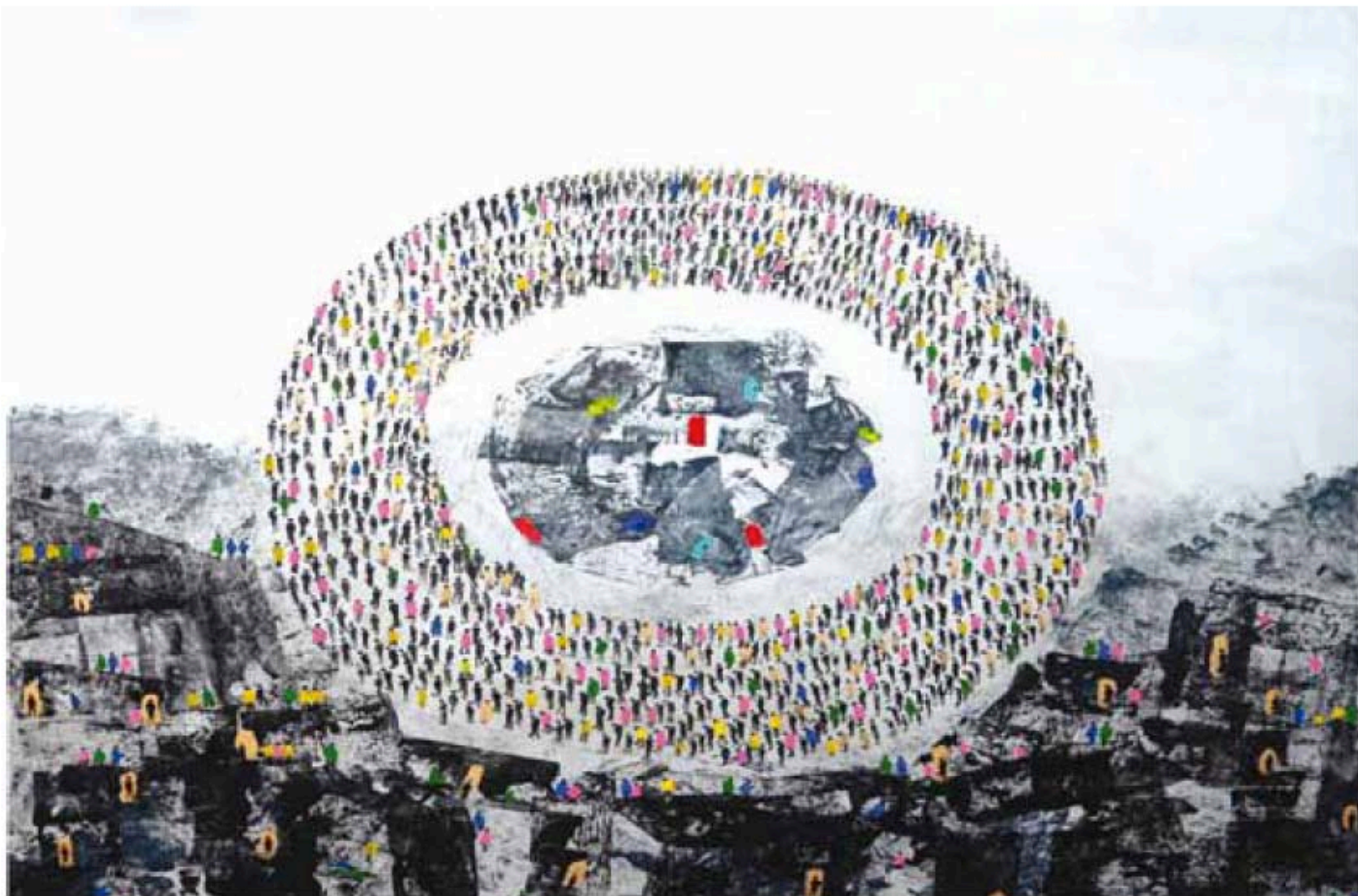
Faika Al Hassan | Mixed Media on Canvas | 100cm x 100cm