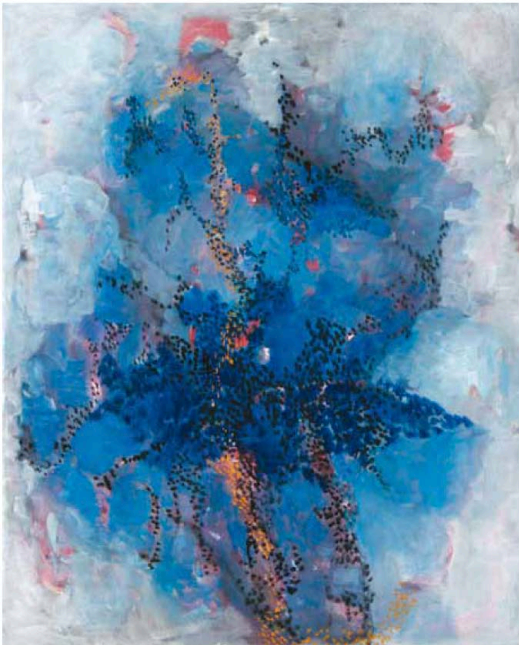
Leila Chalabi | Mixed Media on canvas | 100cm x 80cm