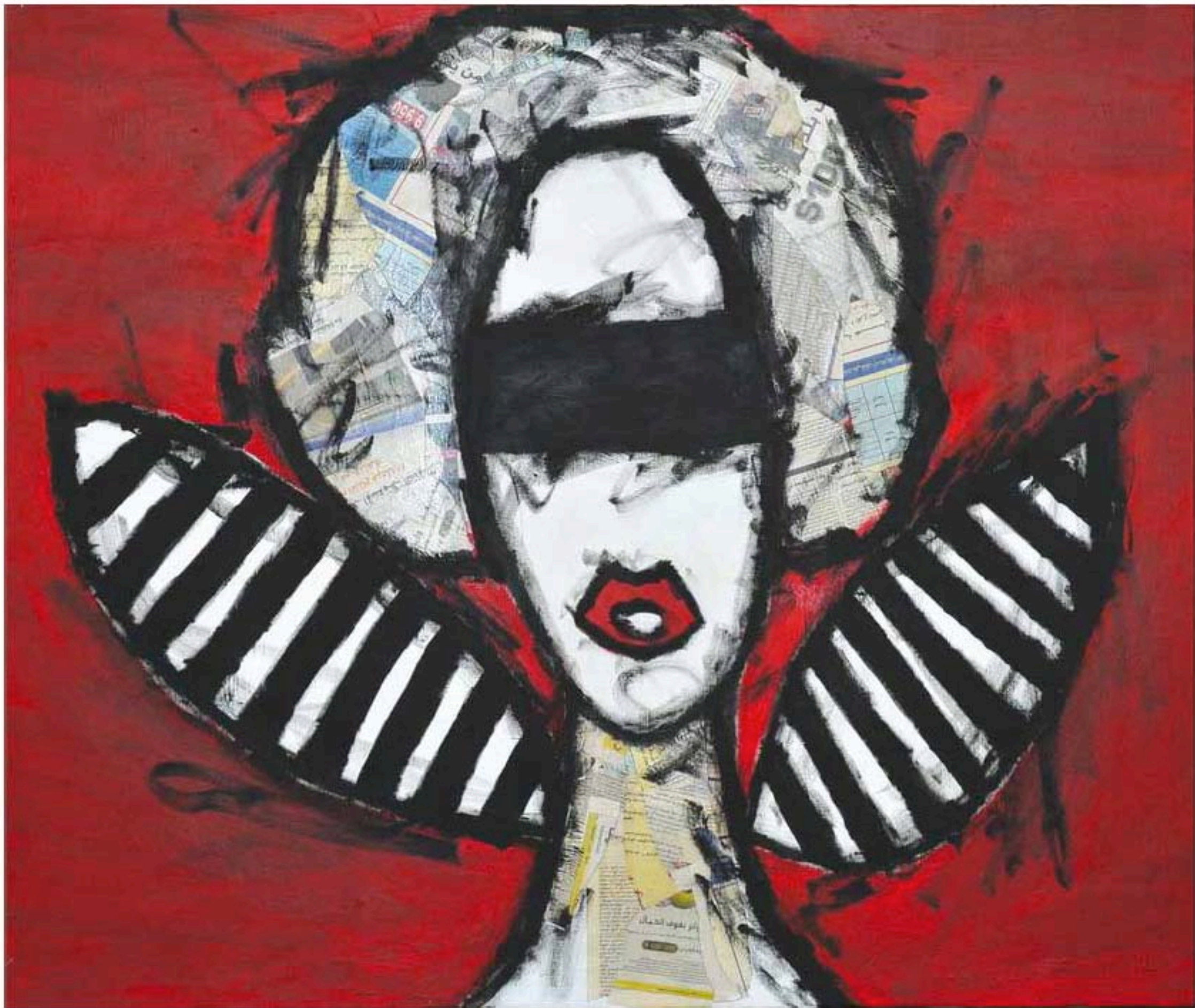
Shereen Audi | Mixed Media on Canvas | 120cm x 100cm