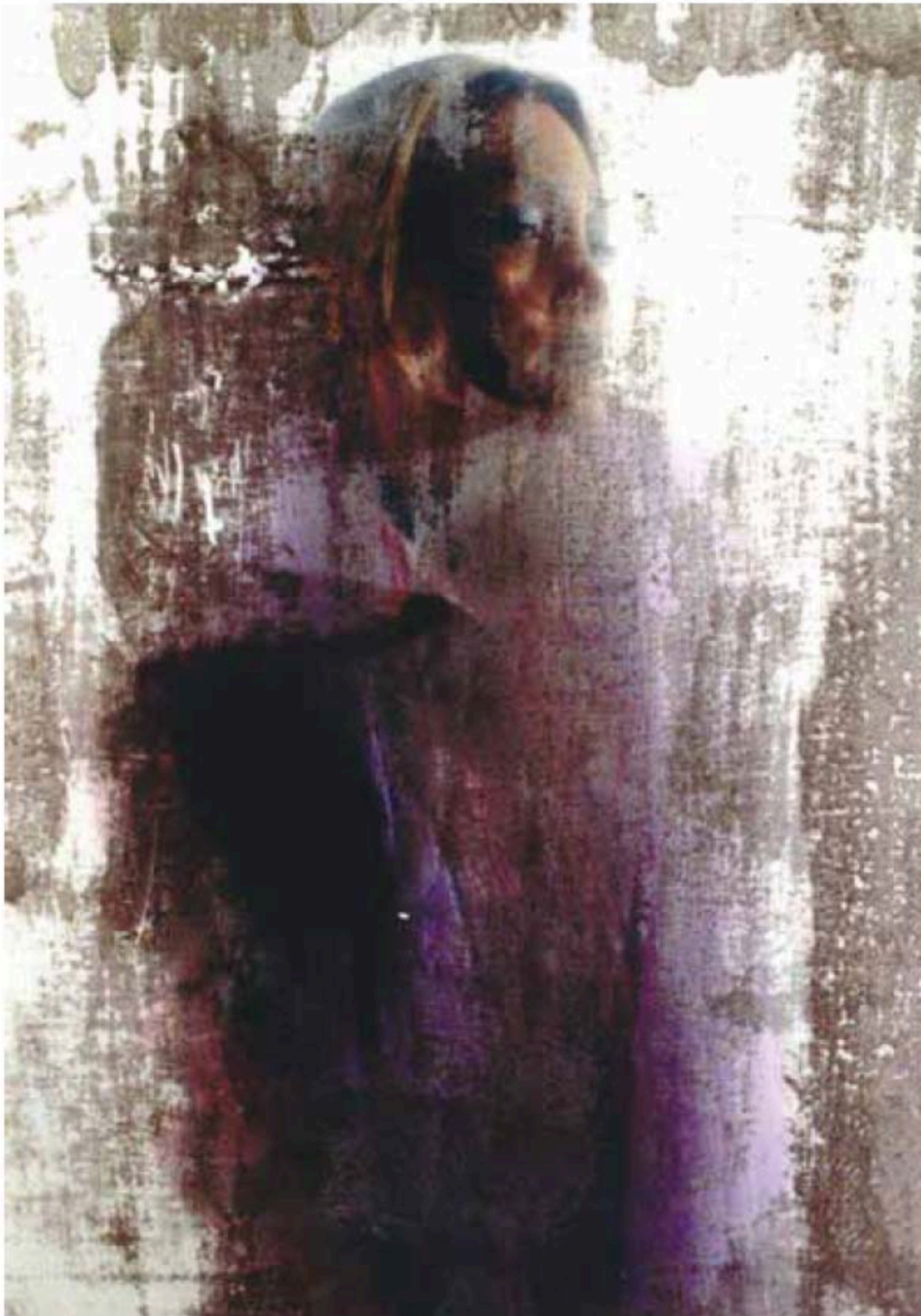
Shadi Ghadirian | "Be Colorful" | C-print | 60cm x 90cm | 2002