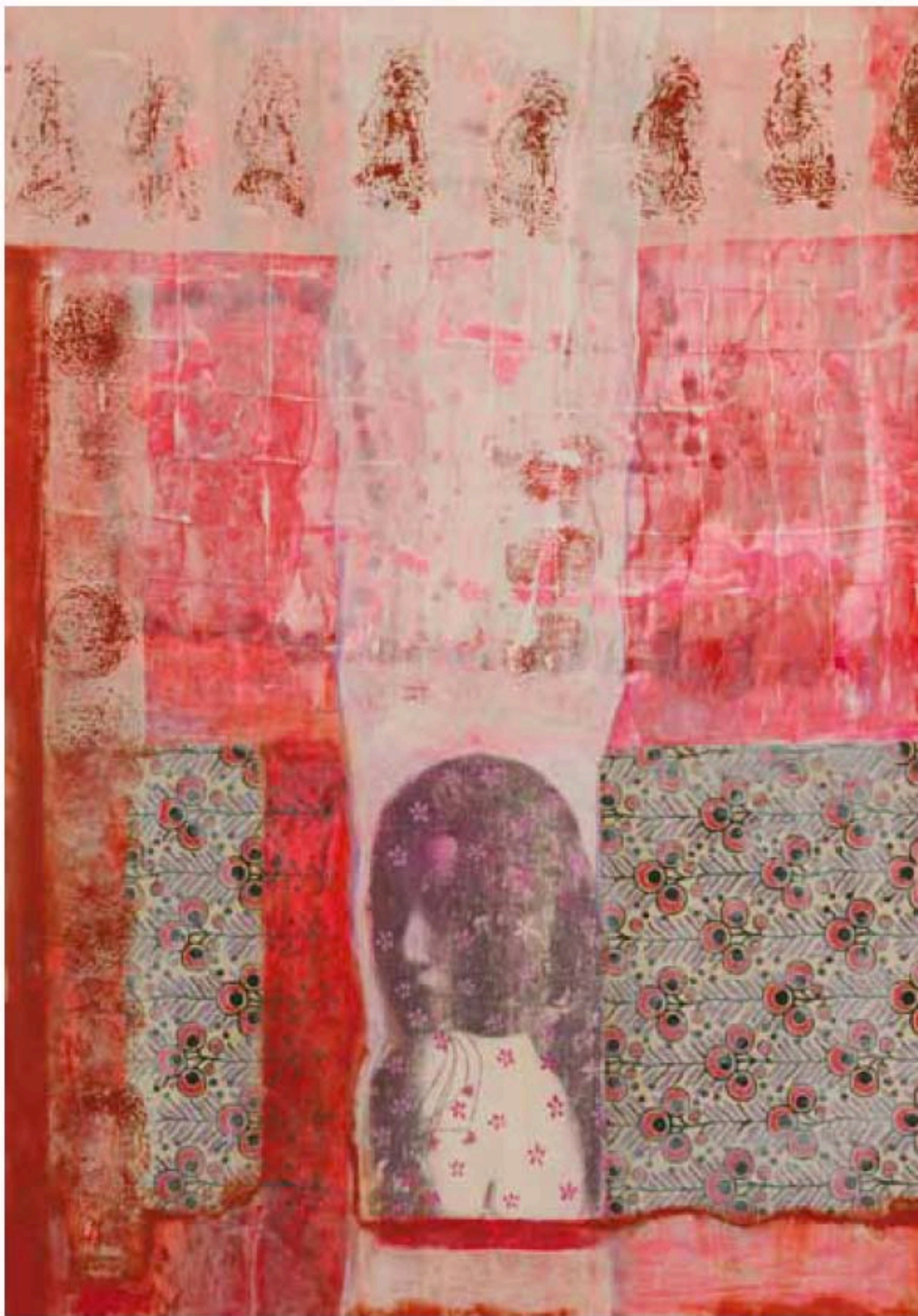
Nabila Al khayer | Mixed media on paper | 100cm x 120cm | 2010