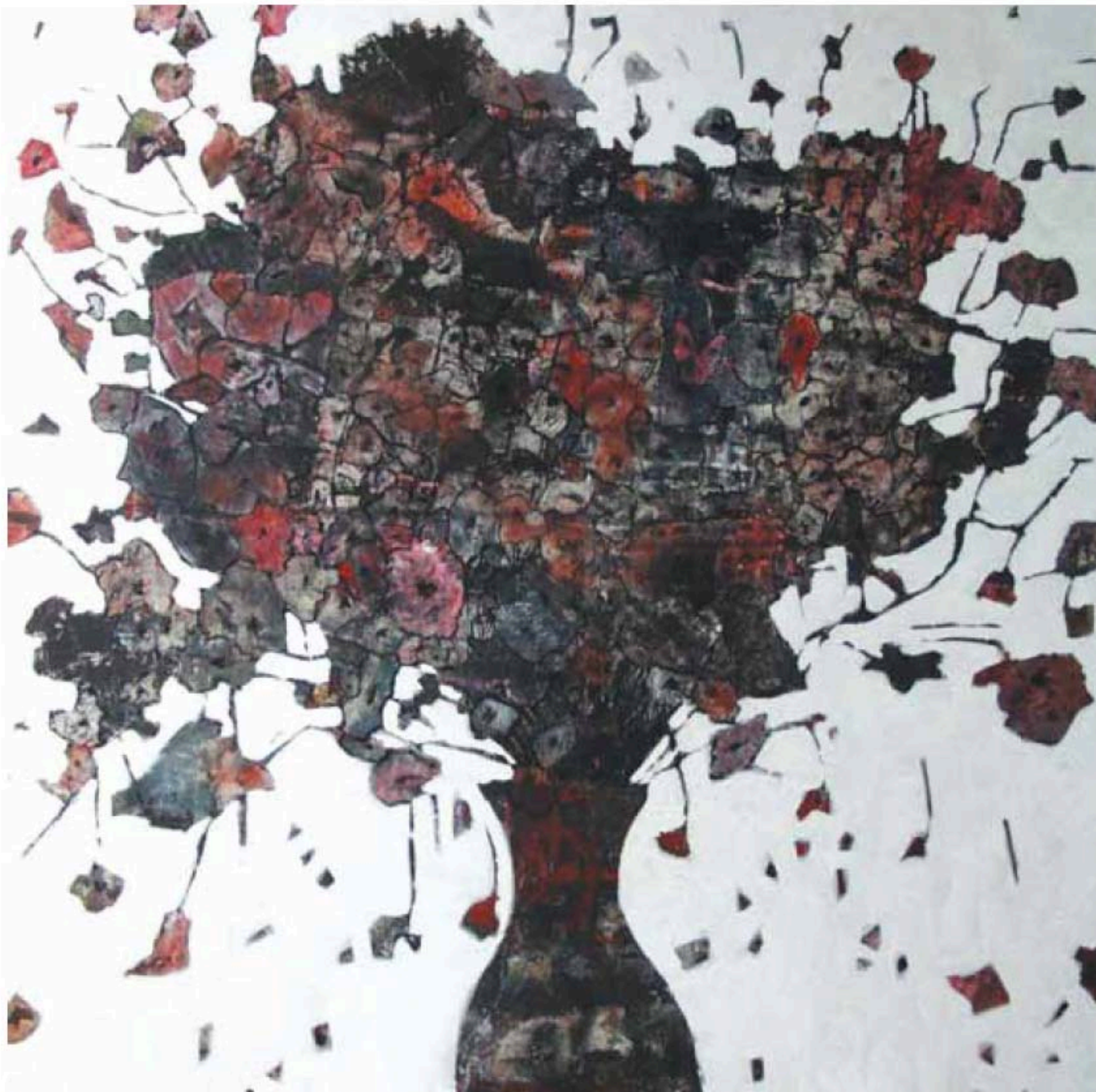
Zena Assi | "Le bouquet" | Mixed Media on Canvas | 190cm x 190cm | 2010