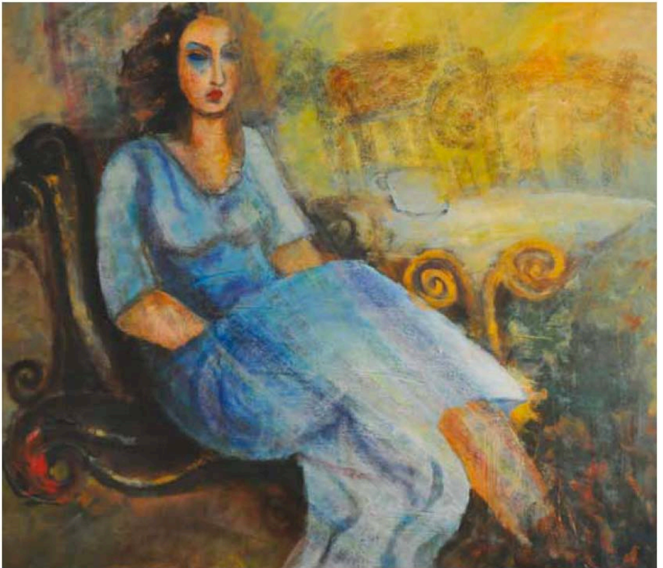
Karima Taha | "Awaiting" | Acrylic on canvas | 120cm x 140cm | 2010